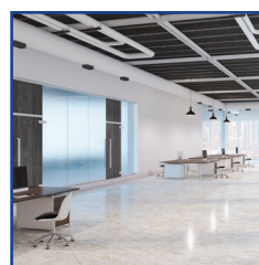
✓ Office Rooms & Washrooms ऑफिस रूम्स & वाशरूम्स