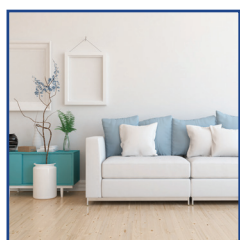
✓ Guest Rooms गेस्ट रूम्स